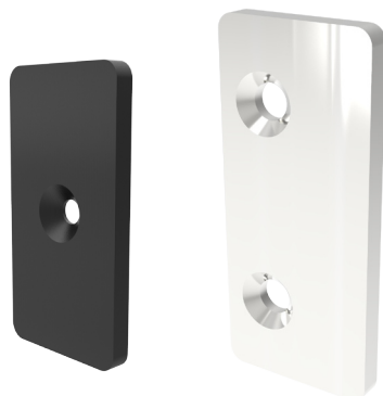
PLASTIC COUNTER PLATE P1830