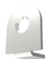
INOX BRACKETS P2050